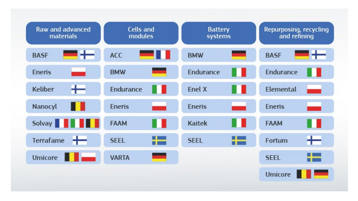
Table 1: Overall structure of the IPCEI Batteries

(35) The table below summarises the companies involved in each WS of the IPCEI Batteries. The projects of each company under the different WS are described in more detail under section 2.4.1 below. Within each of the WS, the participating companies can conduct both R&D&I and FID activities.<sup>7</sup>